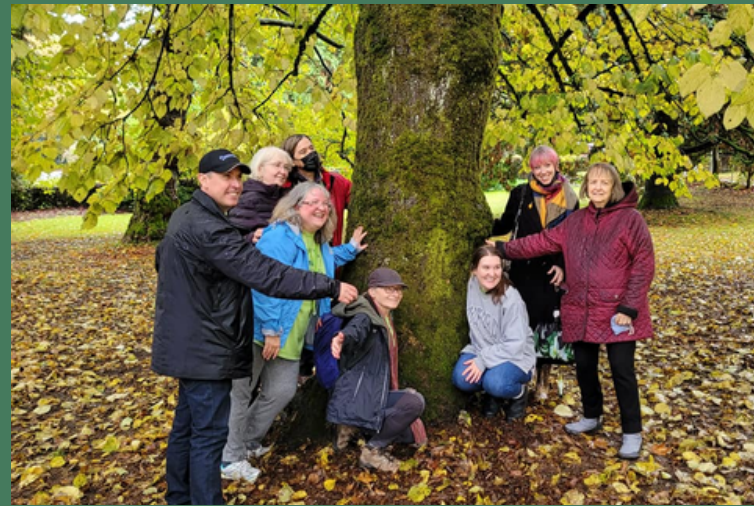
Members, past and present, of the RHCS

WE NEED YOU to come celebrate 30 years of commitment to saving the trees on s̄amiq̄w̄ə?elə/Riverview. Come one and all