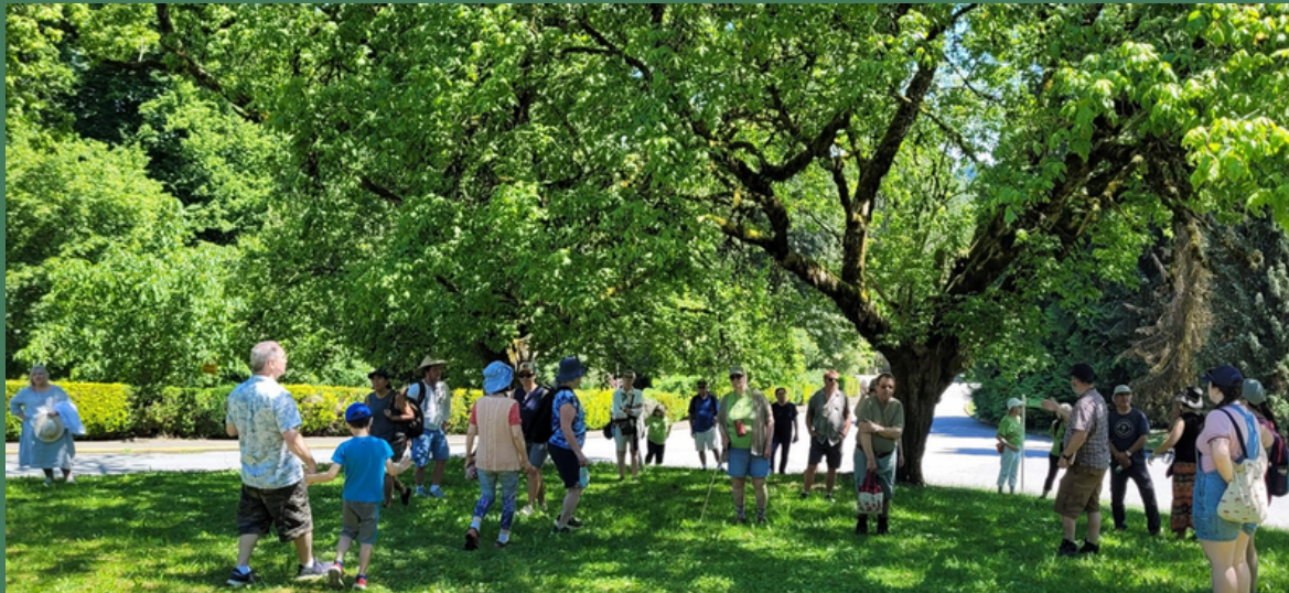
2022 Tree Walk led by Derek Churchill

WE NEED YOU to call your MLA to help us get the BCH fees waived so that we can continue to offer the public free tree walks on public lands.