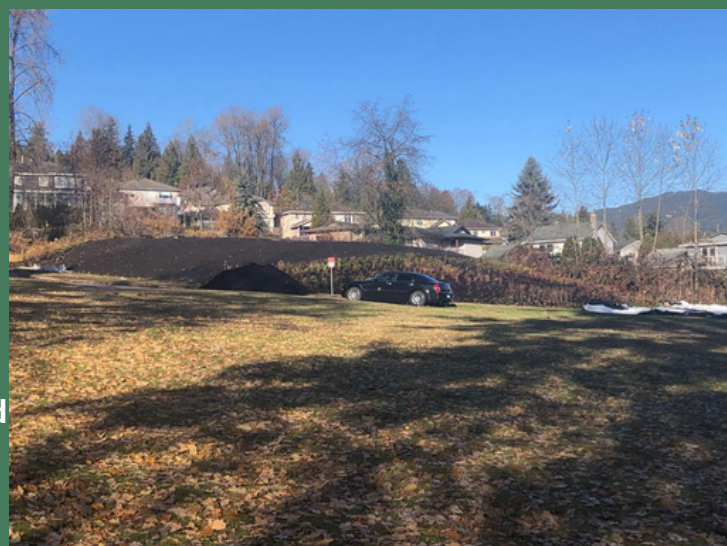
Dirt mound located in the Cemetery at Riverview, photo captured November 27th, 2022