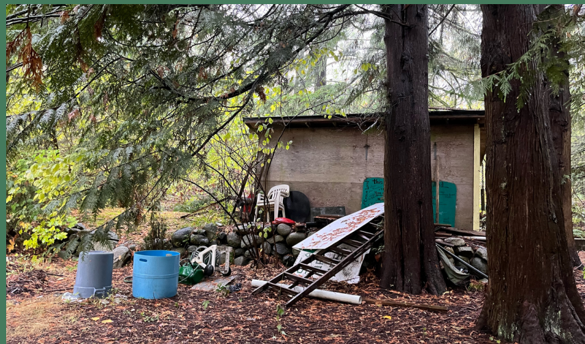
Garden shed located in Finnie's Garden