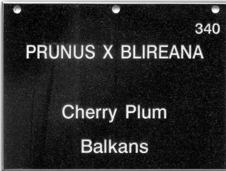
1 of the 300 new labels

I am pleased to report that nearly 300 labels, with Latin and common names, place of origin and tag number have now been installed on trees throughout the Riverview grounds. These were provided by BCBC (now ARES), in partial mitigation for taking greenspace for Connolly and Cottonwood Lodges, and chosen by RHCS members, as representing all genus and most varieties of trees across the Lands, in places where people are likely to walk, or wonder about a particular tree that stands out from others. We have some left to go up, that need to be staked, because of the way the tree grows. So far we have not come up with a safe way to do this. A further 200 labels will be forthcoming.