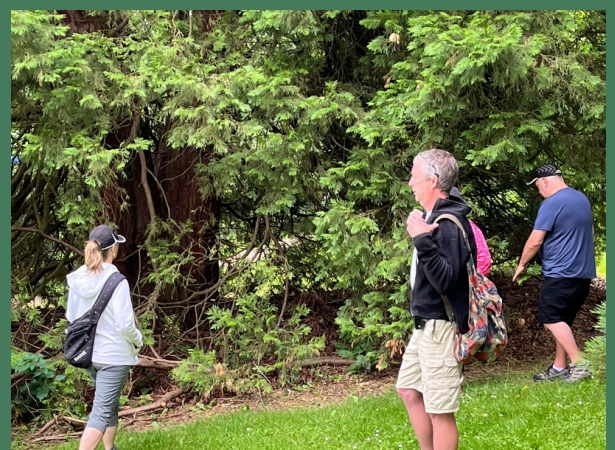
Attendees enjoying a tree walk, July 2022