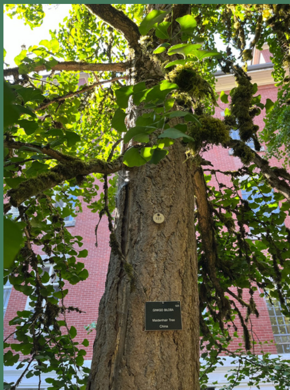
July 2nd 2022