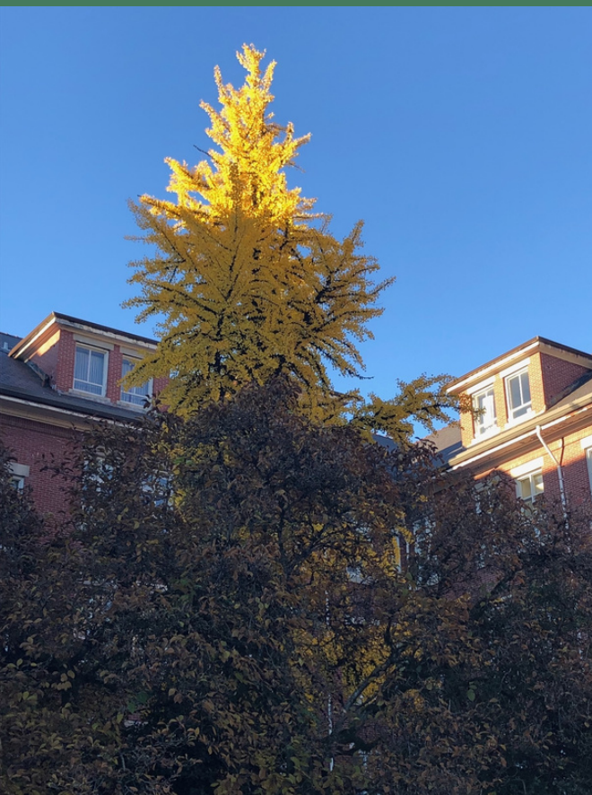
Ginkgo at Riverview by East lawn building