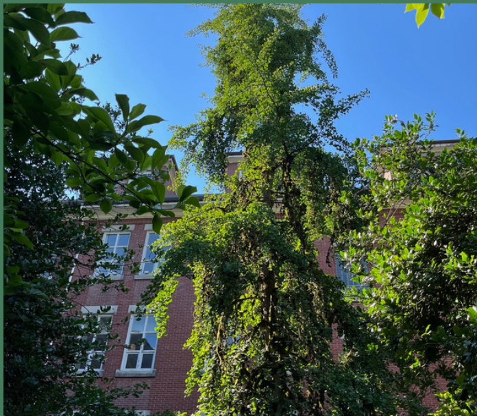
July 2nd 2022

"Neurological Review" Arch Neurol. Nov. 1998